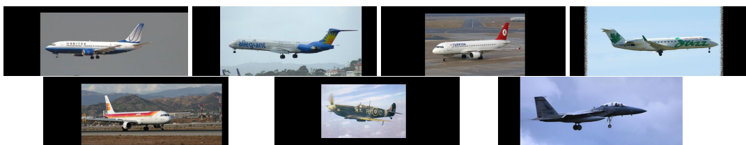
Figure 1: Anchor Images for Aeroplane Category in PASCAL3D+ dataset.