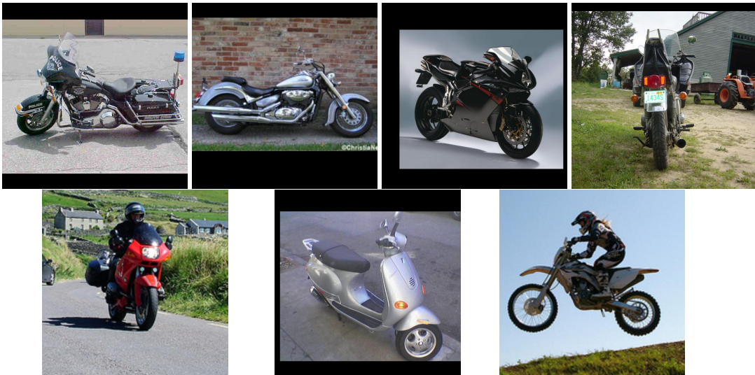
Figure 6: Anchor Images for Motorbike Category in PASCAL3D+ dataset.