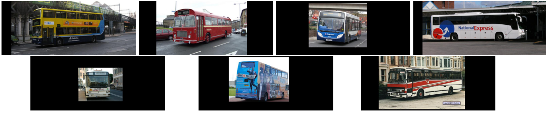
Figure 4: Anchor Images for Bus Category in PASCAL3D+ dataset.