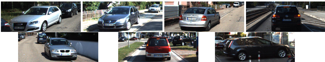
Figure 7: Anchor Images for KITTI dataset.