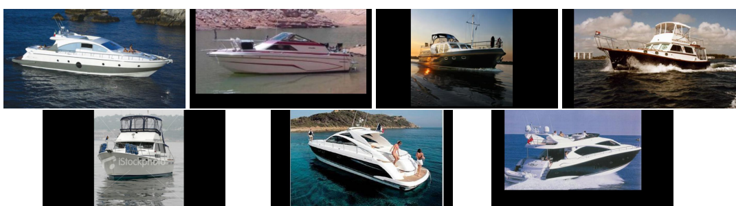
Figure 3: Anchor Images for Boat Category in PASCAL3D+ dataset.