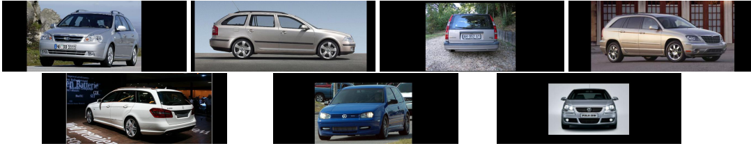
Figure 5: Anchor Images for Car Category in PASCAL3D+ dataset.